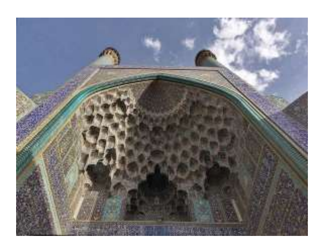
Image 13- The muqarnas decoration of the entrance way of Imam Mosque of Isfahan (www.eadabt.ir)

As to be expected and discussed in various studies on the physical elements of Islamic architecture, features such as domes, minarets, arches and arch ways have been mentioned. Furthermore, design components such as grandeur, magnificence and rhythm have also been suggested by the participants. Moreover, this phenomenon has been of interest in the studies of architecture in monuments such as the Jame Mosque of Yazd and entrance way design of mosques.