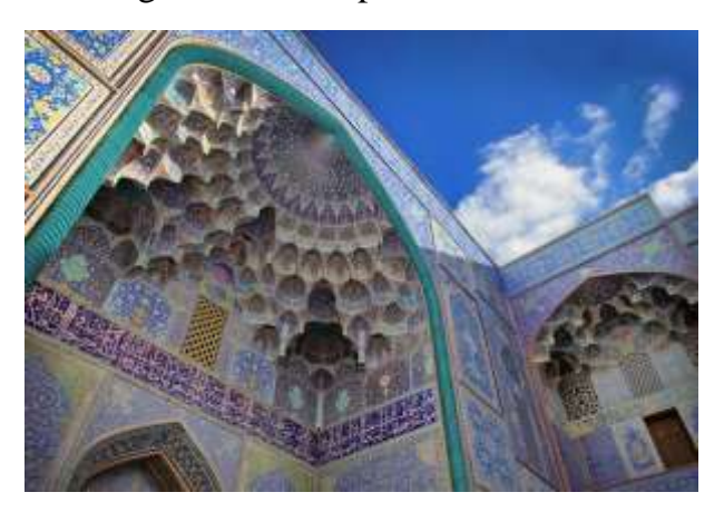
Image 12- The muqarnas decoration of the entrance way of Sheikh Lotfoallah Mosque

Pope also commented on the presence of muqarnas designs at the entrance of the mosques, and in response to the participants by referring entrance way of the mosque he declares: "The exterior of the entrance way is enriched with atriums, niches and masses of stunning muqarnas and long sequences of inscriptions." Pope continues: "The whole façade is covered with a magnificent blue tile, the predominant color of which is located on the underside of the tiles on a golden marble; from the distance of the volume with the awe of this mosque's front, which sometimes looks like a foggy blue, compared to the mild-mannered royal palace, it proclaims the profound superiority of religion over worldly power and the central position of religion in city life" (Pope, 1365: 253). Another example is the use of muqarnas in the sub-dome space, in which Islamic designs along with the element of color provide a magnificent atmosphere (Yavari & Bufa, 2011); hence, adding ornamental beauty. The images mentioned by the participants in Figures 12 and 13, respectively, are from Sheikh Latifollah Mosque and Imam Mosque in Isfahan, due to the different characteristics of these two valuable monuments, they are mentioned several times in regard to the responses.